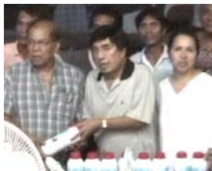
Intensifying productivity of hundreds of farmers from various barangays through agricultural boosters provided to them