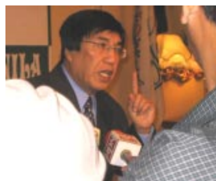
Fears nothing at exposing anomalies in the government, he passionately speaks as he is being interviewed by members of the media