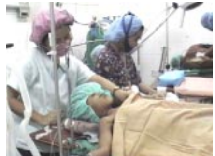
Launching medical-surgical missions that brought to Southern Leyte modern medical facilities where hundreds of indigent patients were given medical attention.