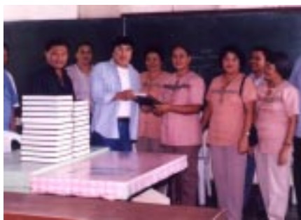
More books and instructional materials have been procured from different institutions were distributed to public school teachers and to the students to make studying a lot more conducive