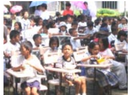
Extending support to school-feeding programs which were launched to provide nutritious food to elementary pupils