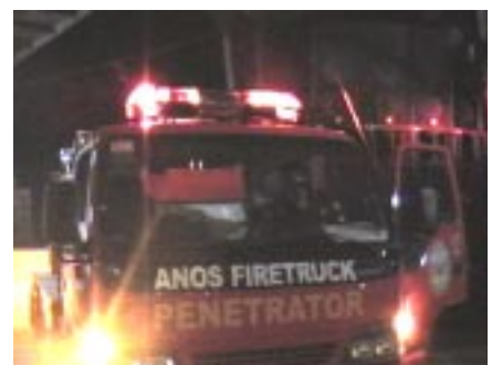
Securing firetrucks and patrol vehicles which were turned over to different local government units in order to strengthen security and order