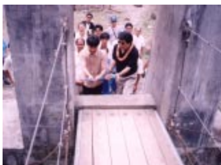
Cong. Saludo inaugurates the newly-constructed foot-bridge in St. Bernard