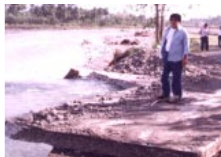
Whenever necessary, the solon inspects the condition of infrastructre projects in the province in order to identify the problems that need to be addressed