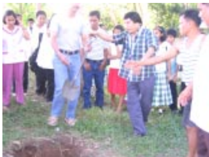
Mayor Erwin Buling assists Cong. Saludo as he leads the ground-breaking of the construction of a school-building in San Juan.