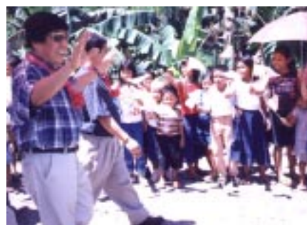
Waving to his constituents, Cong. Odong Saludo feels their triumph as more infrastructre projects are being done in Southern Leyte