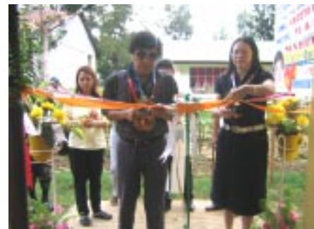
Improving the quality of education as exemplified by the over 200 classrooms constructed and turned-over to municipal mayors