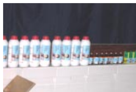
Procurement of fertilizers and livestock vitamins from the Department of Agriculture to reinvigorate agricultural and livestock production in the province