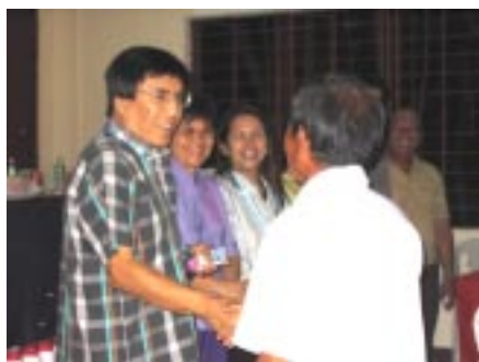
Enhancing agricultural production in Southern Leyte by distributing fertilizers to farmers