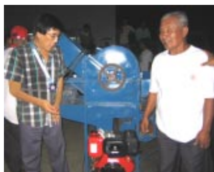
Distribution of rice threshers and other agricultural equipment to various barangays and farmer groups to improve production