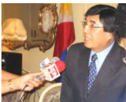
Courageously taking stand, even on controversial issues that put his popularity at stake