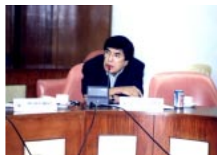
Actively imparting his ideas during committee meetings in the House of Representatives