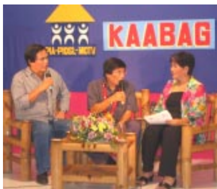
Constantly guesting in different national and local TV and radio programs to express his views on numerous issues