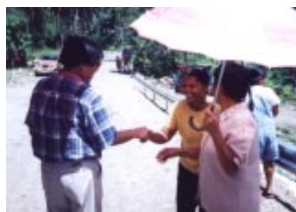
In spite of his hectic schedule, he goes out of his way and takes time to mingle with his constituents