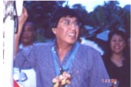
Southern Leyte is close to achieving a 100% energized province because of Cong. Saludo's energization program