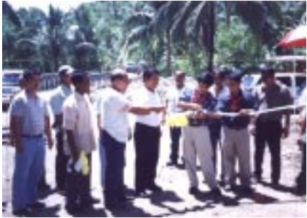
Cong. Saludo has caused the construction of at least 65 bridges in the province of Southern Leyte